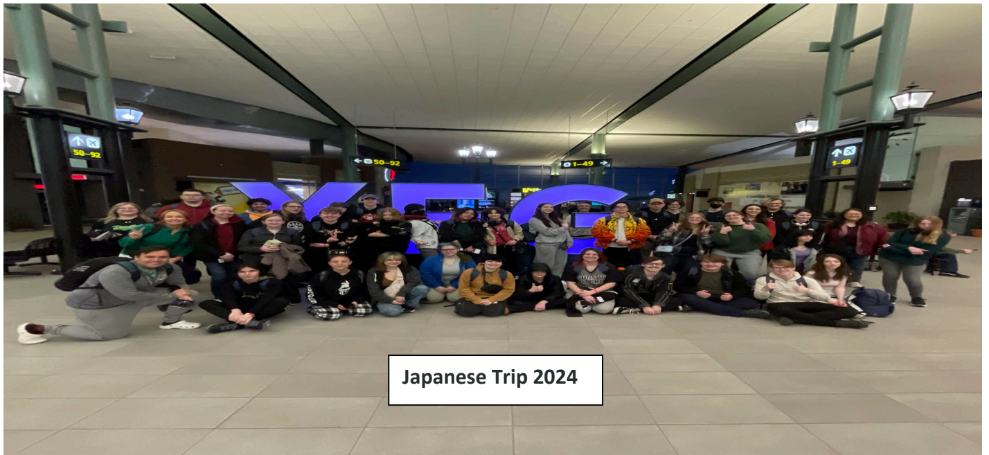
Japanese Trip 2024