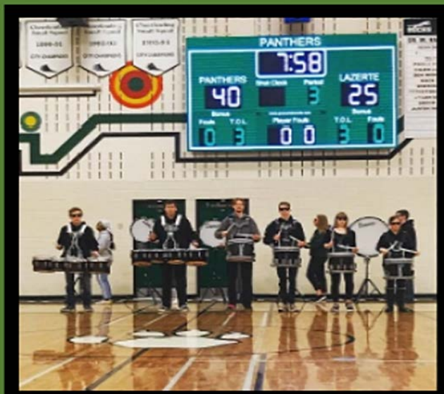
The Panther Drumline made their first performance at a sporting event on Feb. 10 th . We hope to see you at future games!

Join us in the SGCHS Cafeteria at 5:00 pm for a joint concert with several of our feeder schools from Parkland School Division. This concert will feature the best middle school musicians from across the division in collaboration with their high school peers.